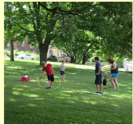
Children having fun hula hooping