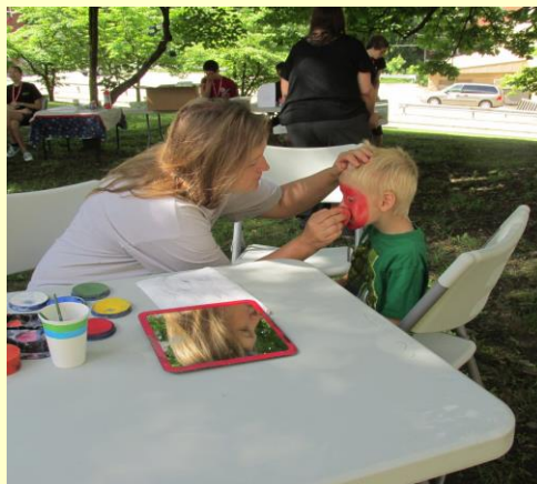
Face painting by Liz Jones Arts